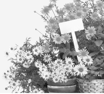
The 12th Annual Young People's Network Night on April 1