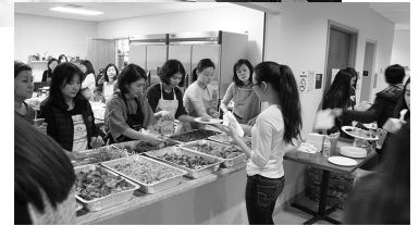
17th Annual KCC Gala on April 22