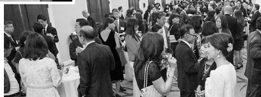
13th Annual Children's Art Contest Award Ceremony on May 20