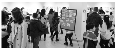
Award Ceremony for the 12th Children's Art Contest on May 7