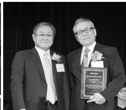
The 16th Annual KCC Gala 2016 on April 16