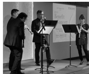
Benefit Concert by KCC Women's Club on September 29