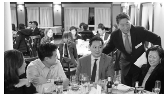
Annual Appreciation Dinner for Honor Society on December 8