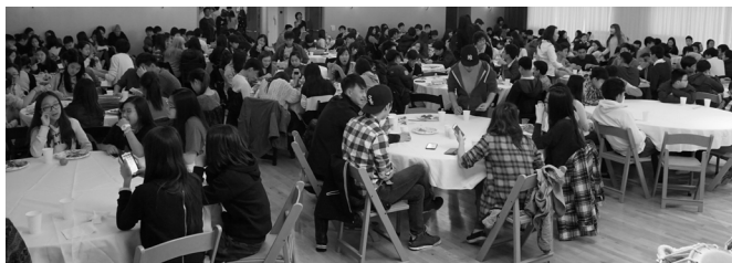
The 11th Annual Young People's Network Night on April 9