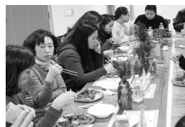
Annual Volunteer Appreciation Lunch on December 14