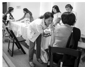
Healthy Living Festival on October 15