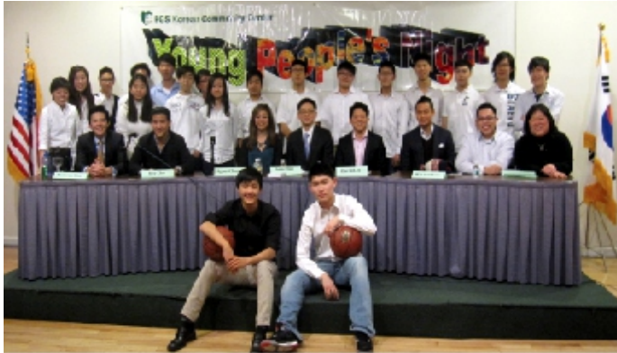
▪ Young People's Network