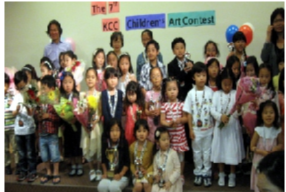
▪ Children's Art Contest