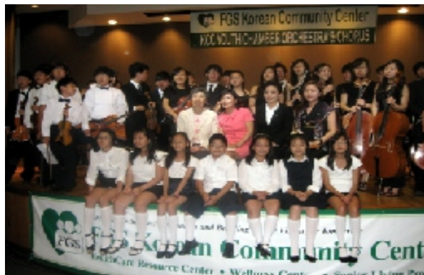
▪ Youth Chamber Orchestra & Chorus