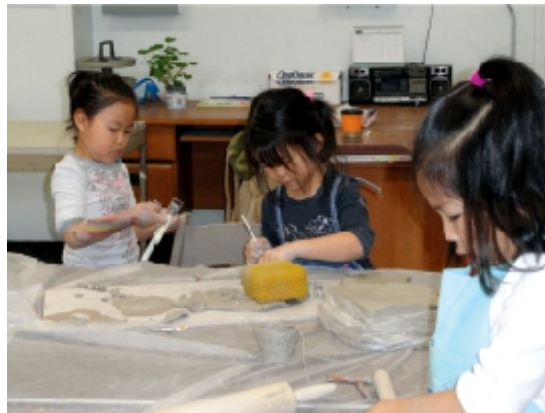
▪ Classes for Arts, Ballet and Musical