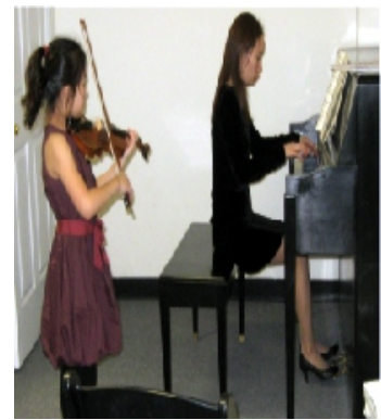
▪ International Virtuoso Music Contest