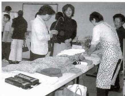
Fund Raising Annual Bazaar