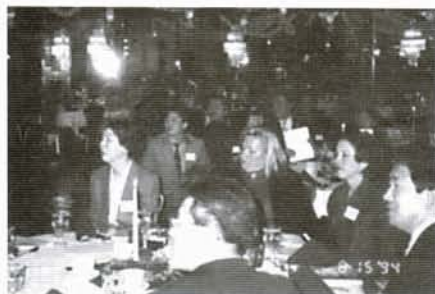
Fund Raising Annual Dinner